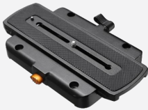
1x P13 Quick Release Adapter with Plate