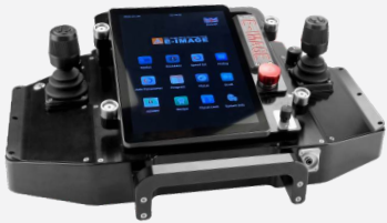
1x Camera Control Board