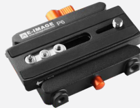
1x P6 Quick Release Adapter with Plate