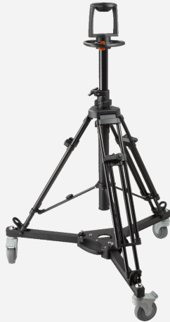
1x AT7903 Pedestal