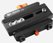
1x P6 Quick Release Adapter with Plate