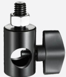
1x MT-019 Male 3/8" thread with 5/8" socket Adapter