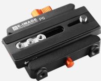
1x P6 Quick Release Adapter with Plate