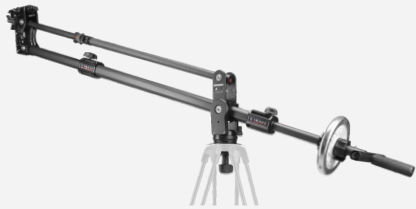
1x EJ100S Carbon fiber Jib Arm

What's included: EJ100S + GA752 + EI-7004