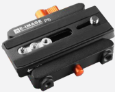
1x P6 Quick Release Adapter with Plate