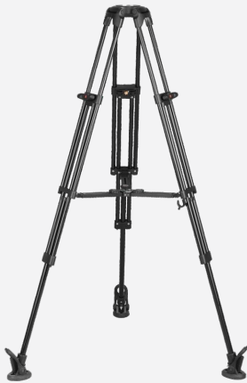
1x GA752 75mm Aluminum Video Tripod