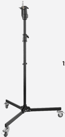
1x RS-860 Folding Wheeled Base Roller Light Stand

What's included: RS-860 + MT-019 + BSA-04 + S-009