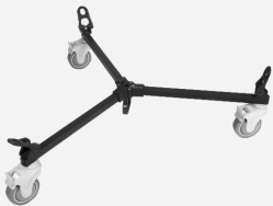
1x EI-7004 Medium Dolly