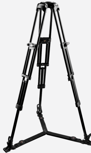
1x GA102 100mm Aluminum Video Tripod

What's included: GA102 + 100BF + MS-010 + P6