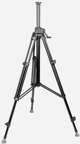
1x GA230 Pro Geared Video Tripod