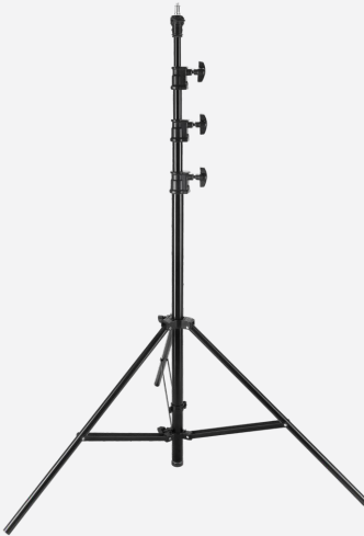
1x LS-PRO38 Light Stand

What's included: LS-PRO38 + BSA-04 + S-009