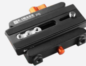
2x P6 Quick Release Adapter with Plate