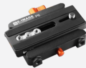
1x P6 Quick Release Adapter with Plate