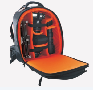
Compact size makes it ideal for travel and can put in your camera bag.(ES30/40 put into Oscar B10)