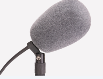
Foam windscreen with high purity anti-spray sound, soft touch. Easy to clean and not deformed and other functions.

The gold plated XLR link makes audio frequency current with ideal transmission.